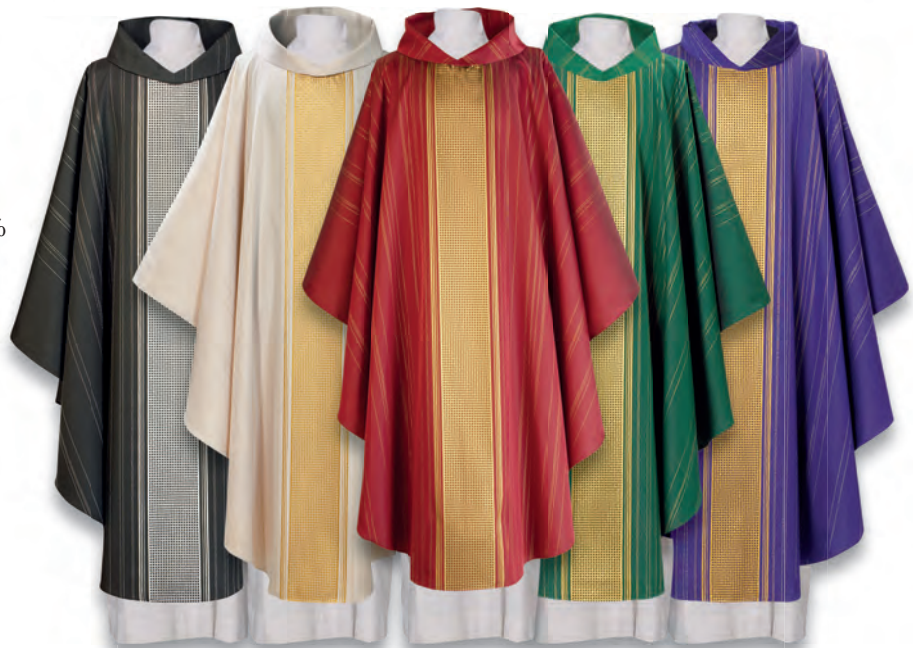
Réf. 700151 noir Réf. 700151 blanc Réf. 700151 rouge Réf. 700151 vert Réf. 700151 violet