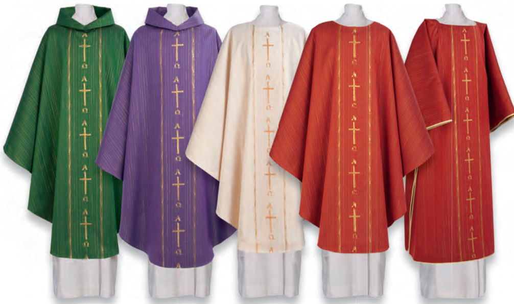
102-700249 purple 102-700249 green 101-700249 white 101-700249 red 111-700249 red

72% polyester, 22% acetate and 6% lurex. Executed in a breathable poly-weave, this collection comes in white, red, green and purple. The chasubles have an ample gothic cut with a 61" width and 53" length and include an inner stole.