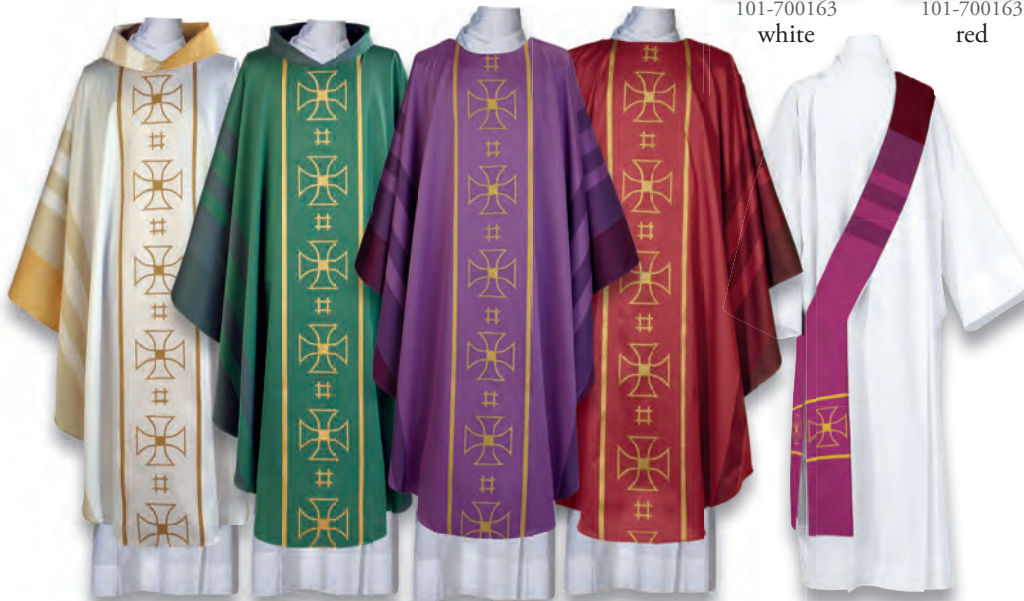
102-700107 white 102-700107 green 101-700107 purple 101-700107 red 121-700107 purple