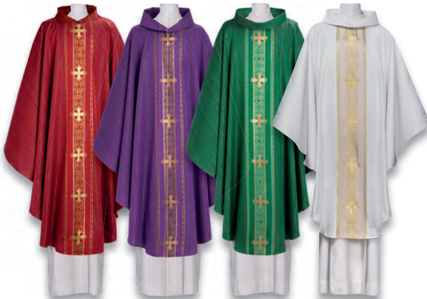
102-700239 red 102-700239 purple 102-700239 green 102-700239 white