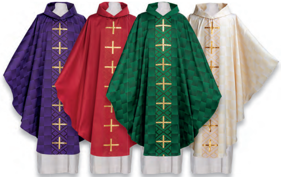
102-7262 purple 102-7262 red 102-7262 green 102-7262 white