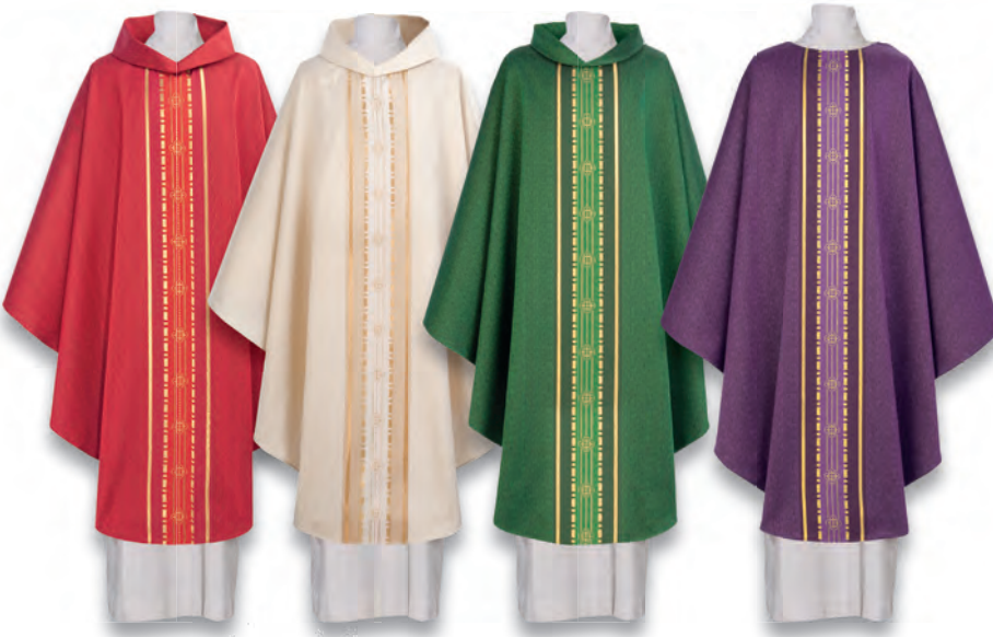
102-700247 red 102-700247 white 102-700247 green 101-700247 purple