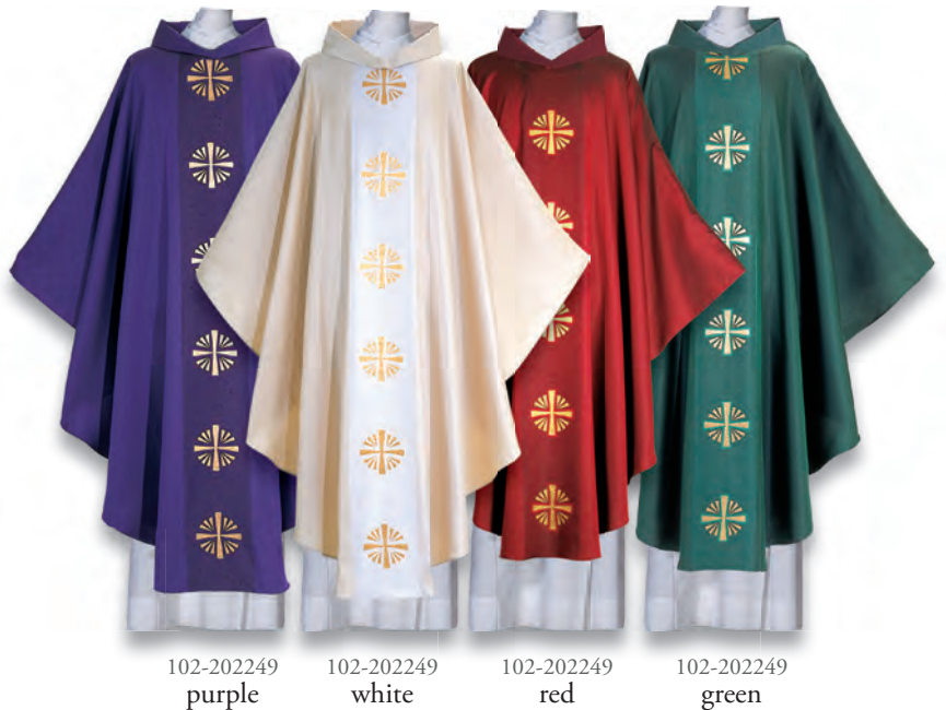
102-202249 purple 102-202249 white 102-202249 red 102-202249 green