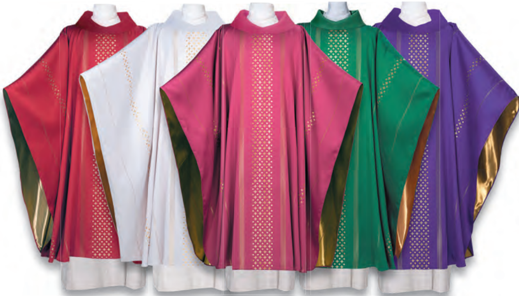
102-7708 red 102-7708 white 102-7708 rose 102-7708 green 102-7708 purple