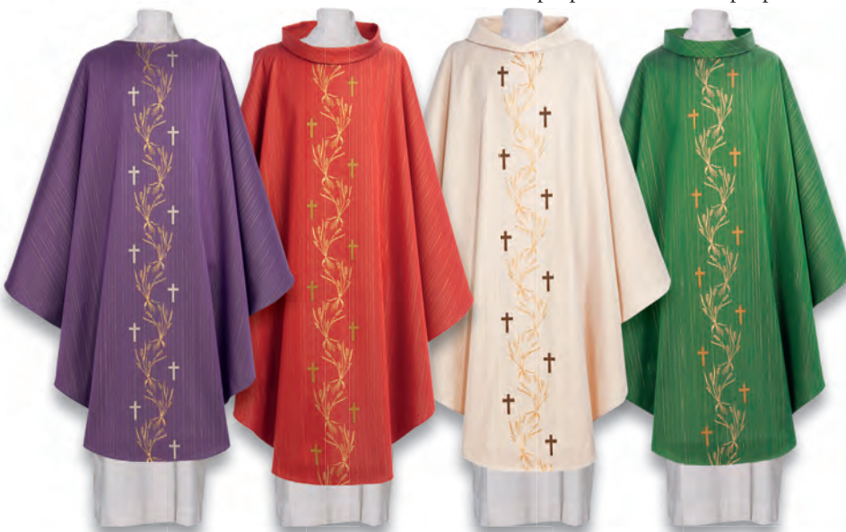
101-700248 purple 102-700248 red 102-700248 white 102-700248 green