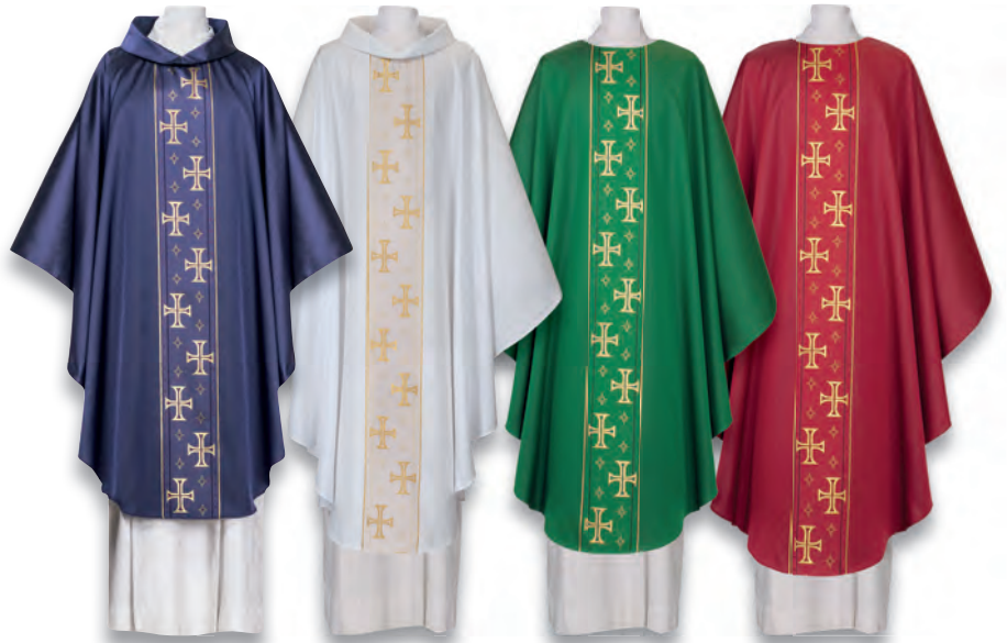
102-700232 purple 102-700232 white 101-700232 green 101-700232 red