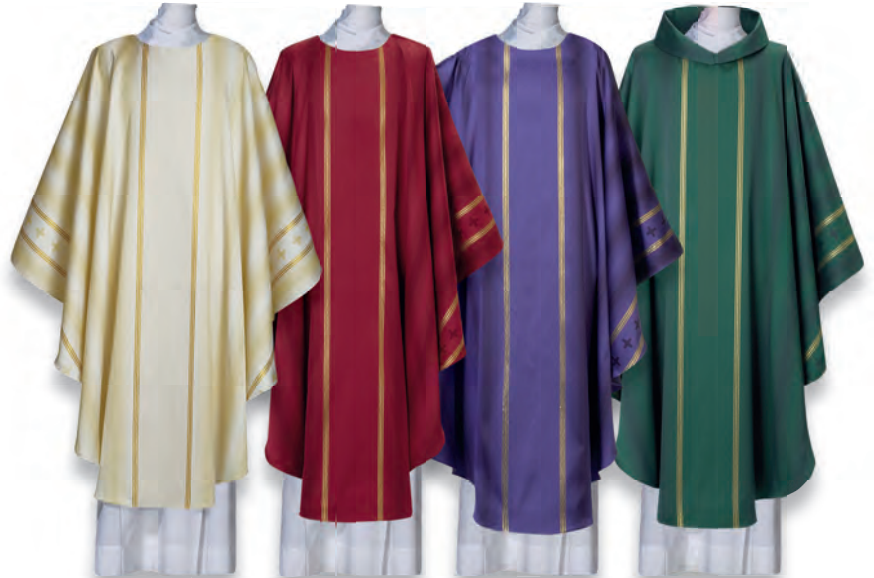
101-700163 white 101-700163 red 101-700163 purple 102-700163 green