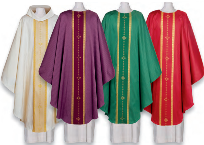
102-700222 white 101-700222 purple 101-700222 green 101-700222 red