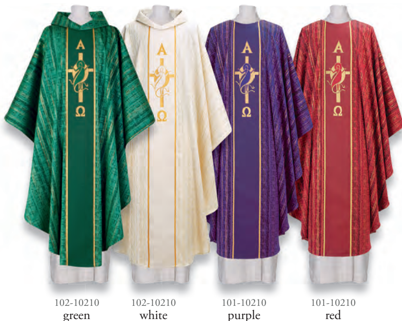
102-10210 green 102-10210 white 101-10210 purple 101-10210 red