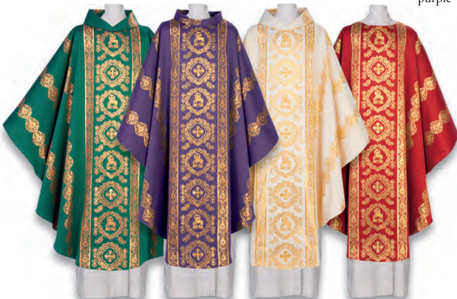
102-6260 green 102-6260 purple 102-6260 white 101-6260 red