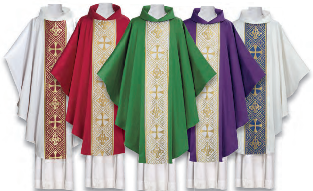
102-7014 white-red 102-7014 red 102-7014 green 102-7014 purple 102-7014 white-blue

Lining for chasuble, dalmatic and cope $ 210