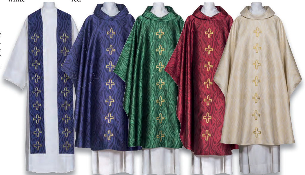
120-72017 purple 102-72017 purple 102-72017 green 102-72017 red 102-72017 white