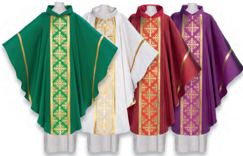
102-7260 vert 102-7260 blanc 102-7260 rouge 102-7260 violet