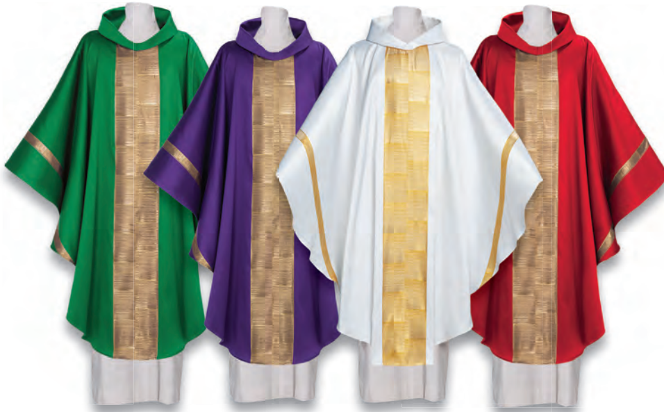
102-7263 green 102-7263 purple 102-7263 white 102-7263 red