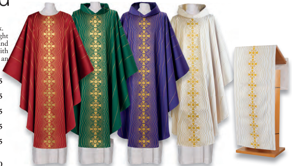
101-700127 red 102-700127 green 102-700127 purple 102-700127 white 161-700127 white