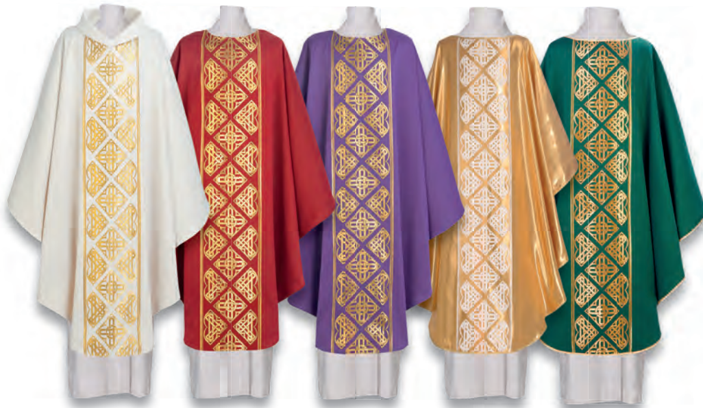
101-6315 white 101-6315 red 101-6315 purple 101-6315/R gold 101-6315/R green