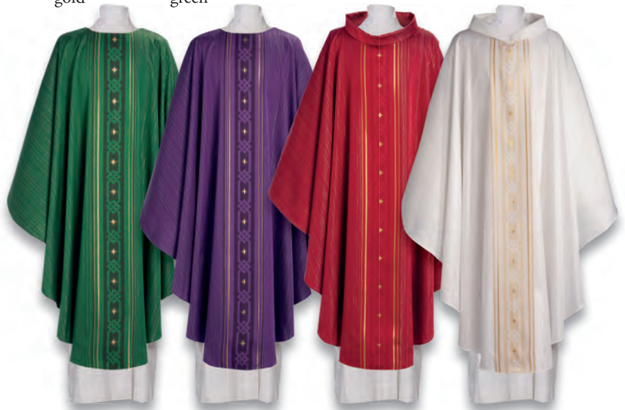
101-700241 green 101-700241 purple 102-700241 red 102-700241 white