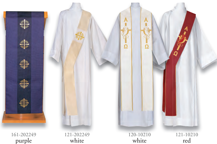
161-202249 purple 121-202249 white 120-10210 white 121-10210 red