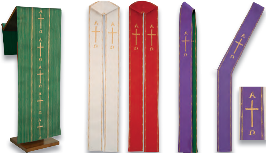
161-700249 green 120-700249/S white 120-700249/S red 120-700249/R purple/green 121-700249 purple