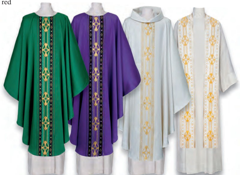
101-700231 green 101-700231 purple 102-700231 white 120-800066 white